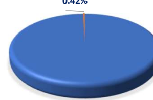
DYNAMIC OAS V POSITION